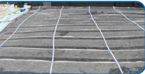
Monitoring Grid under Green Roof