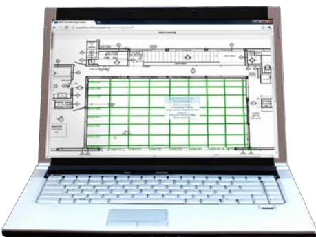
Updated Status in Real Time