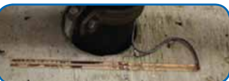
Services Entrance Monitoring