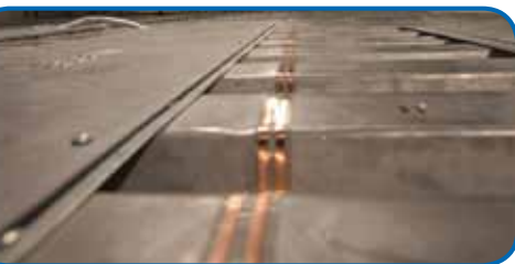
Interstitial / Mechanical Space Monitoring